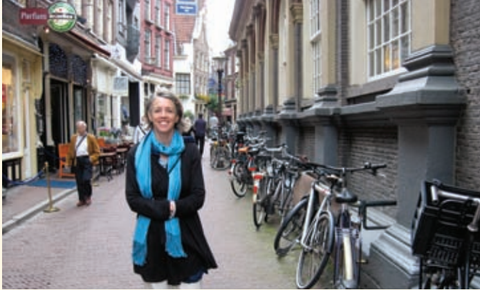
Mukti will be offering satsang and a silent retreat day in Amsterdam, NL

Mukti will be teaching in the following areas in 2014: